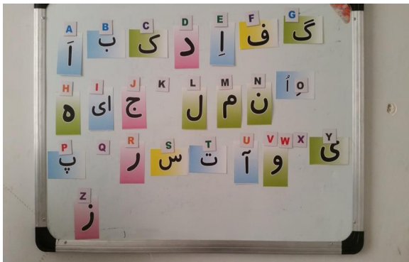
Picture 4, using Persian equivalent as mnemonic

After learning the letters and corresponding sounds, she was made to make the mono syllabic regular words using tactile, kinesthetic and visual senses (Picture 5). Based on MSL strategies Language concepts were taught in logical, sequential steps from simple to more complex tasks.