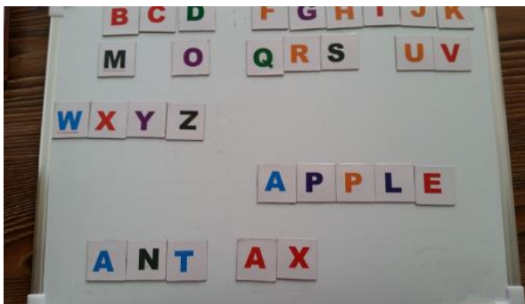
Picture 5, Making words with magnet letter based on sounds

She was presented with the word in printed form and her attention was directed to the most important phonemes of the word not irregularities. If there was silent letter, she was told not to read them. She was asked to identify initial sounds in words and engage in sound blending activities, letter sound