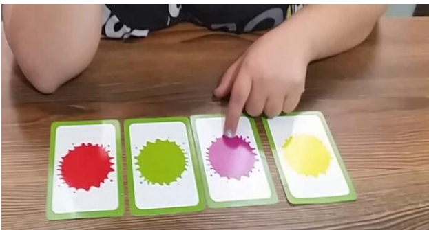
Figure 2, Flash cards

Considering her mental age (six years old) based on "Draw-a-Person tests", American First Friend 1 published by Oxford University Press was chosen. It is a phonemic program designed to develop letter recognition skill and letter formation. This book comprised of 10 units focusing on learning alphabets and vocabularies. Other material used along with the book were flashcards, Persian and English magnet alphabets and a magnet board. (Pictures 2 & 3).