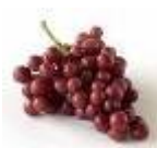
1 kilogram of grapes

Instructions: Your friend is going to the supermarket. Below is a list of TEN (10) things you need, in order to prepare dinner for you and your family. Use the phone to talk to her. Tell him/her in English what you need ( do not use Farsi to do this task ). If he/she does not understand what he/she has to buy, explain in English and use all of the details. You have 10 minutes to complete the task.