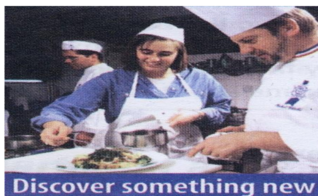
Figure 4: Interchange Student's Book 2 (Richards, 2005, p. 30).

As is shown in Figure 4, the frontal plane of the woman in this figure is parallel to the frontal plane of the viewer. She is, thus, depicted as someone who belongs to the viewer's world or someone with whom the viewer is involved. The male participants, however, are shown from an oblique angle. They are, thus, represented as others, as detached from the viewer. They are,