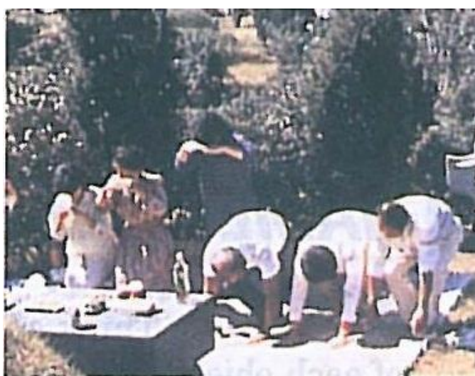
Figure 9: Interchange Student's Book 2 (Richards, 2005, p. 55).

Figure 9 shows three men and three women while doing a part of a Korean custom. The represented participants of this photograph are depicted in active roles since all of them are shown in narrative representations involved in non-transactional action processes. Non-transactional action includes only actors and does not have any goal for which the action may be done. In fact, non-transactional action functions like sentences with intransitive verbs. A sentence with the continuous tense, e.g. 'They are praying before the graves of their ancestors', would be an appropriate equivalent of this representation if one wishes to translate it into the verbal mode. However, in this active representation, the three women are disconnected from the male participants by framing. In this photograph, framing is achieved by the discontinuity of the white color of men's clothes, the framelines formed by the white cloth spread on the ground and the