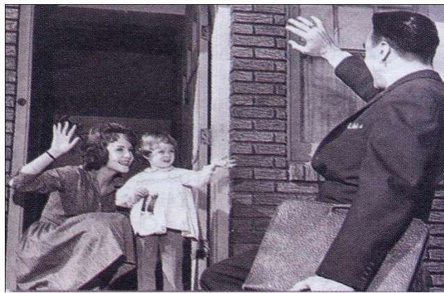
Figure 7: Interchange Student's Book 2 (Richards, 2005, p. 14).

The two female participants in Figure 7 are, on the one hand, separated from the man by the framelines formed by the right edge of the door and, on the other hand, they are represented as belonging to the context of home because they are positioned within the frame formed by the edges of the door and also the dark shade behind them. In fact, the edges of the door and the dark part within the frame of the door divide the picture into two parts: home and outside . The man is depicted as belonging to outside (activities) while the females are shown as belonging to home; these representations also seem to be stereotypical.