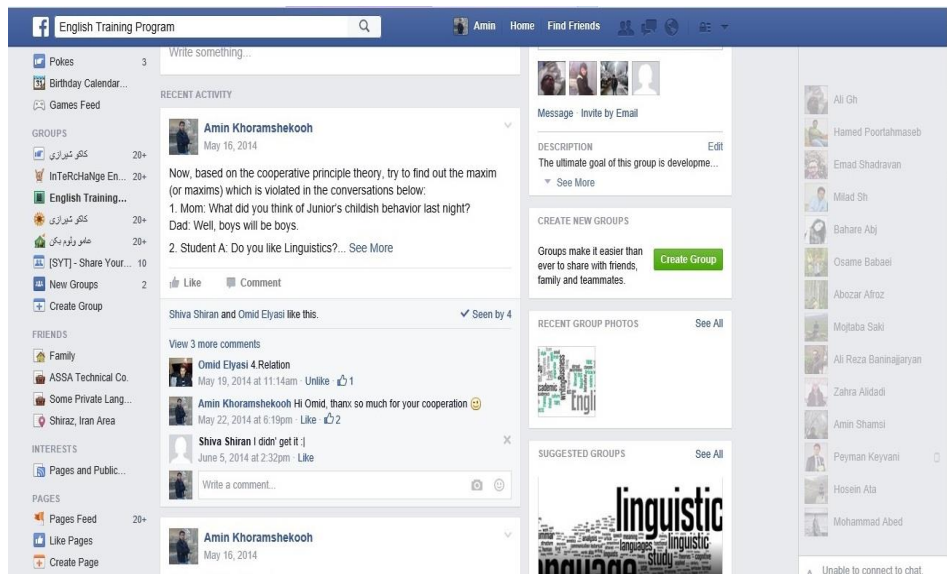
Figure 2 The APMC group's virtual instructional environment

The participants of the control group, also, received the instructional materials two times a week (each time about half an hour) through traditional teacher-fronted classroom setting. In each session, they were provided with a dialogue containing implicatures in a specific context. Then, they were encouraged to interpret the dialogue and discuss it with their peers. Afterwards, they were given meta-pragmatic information about how to interpret each implicatures type.