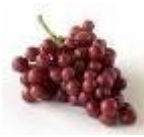
1 kilogram of grapes

Instructions: Your friend is going to the supermarket. Below is a list of TEN (10) things you need, in order to prepare dinner for you and your family. Use the phone to talk to her. Tell him/her in English what you need ( do not use Farsi to do this task ). If he/she does not understand what he/she has to buy, explain in English and use all of the details. You have 10 minutes to complete the task.