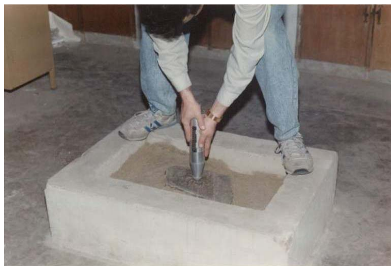
Fig. 1: Measurement of uniaxial compressive strength (JCS) by L-type Schmidt rebound hammer under saturated condition.

up to 30 cm. The samples were placed firmly in the fine sand to avoid sample movement during experiment (Fig.1).