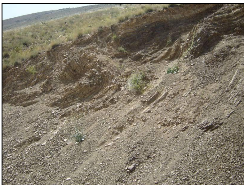
Fig.3 A part of Pourkan-Vardij fault zone

There are several faults in the tunnel route. The main fault zone and crushed zone is Pourkan-Vardij fault zone that cuts the tunnel route in 6417 to 6442 meter from end of the tunnel (Fig.3). It should be noted that CZ and FZ show crushed and fractured zones respectively due to fault activity.