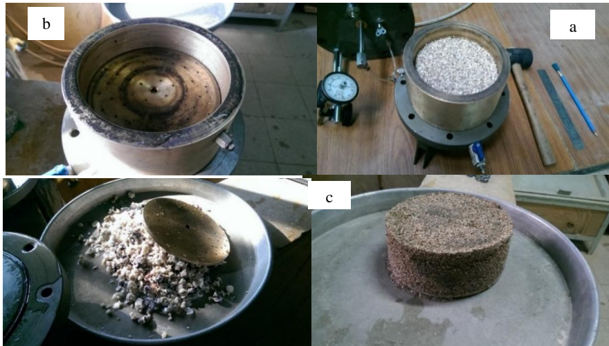
Figure 1. Material and apparatus a) Rowe Cell, b) Sand inside Rowe cell, c and d) Specimen after loading

(Figure 1). Poorly graded sand samples with big, medium and small size particles (in margins of sand definition) were tested.