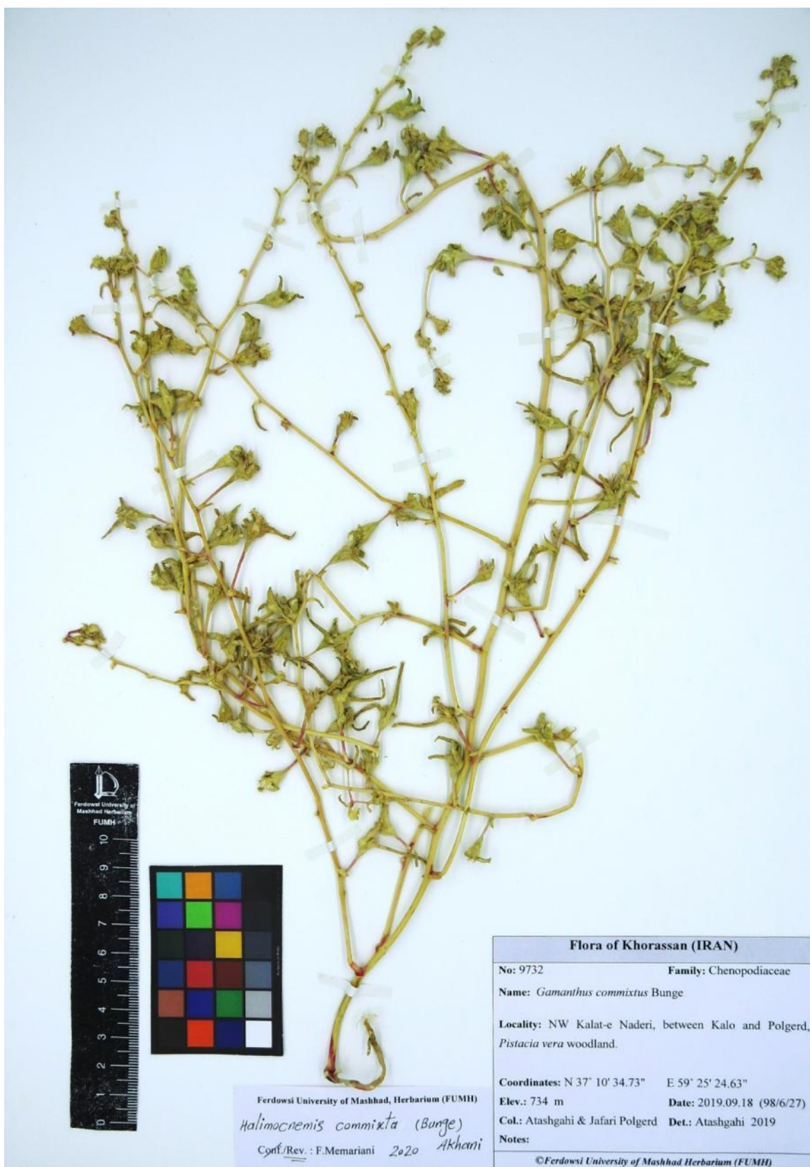
Figure 1. Herbarium specimen of Halimocnemis commixta (Atashgahi & Jafari Polgerd 9732-FUMH).