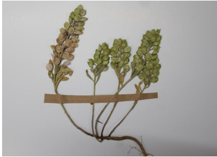
Fig. 1. Plant on sheet of Herbarium ( A. mazandaranicum ).