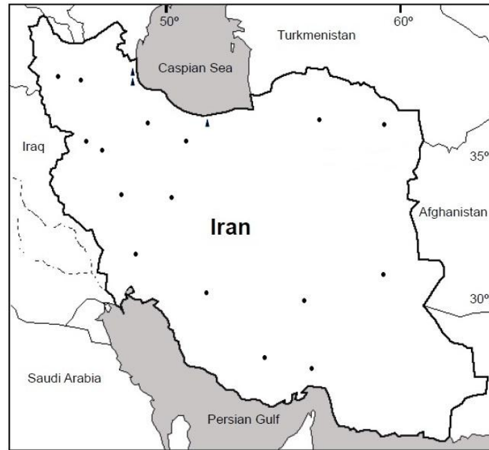
Fig. 3. Distribution of Alyssum szowitsianum (●) and A. mazandaranicum (▲) in Iran.