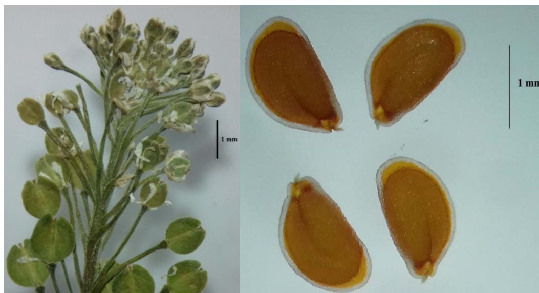
Fig. 3. Inflorescence (left) and seeds (right) of Lepidium virginicum .