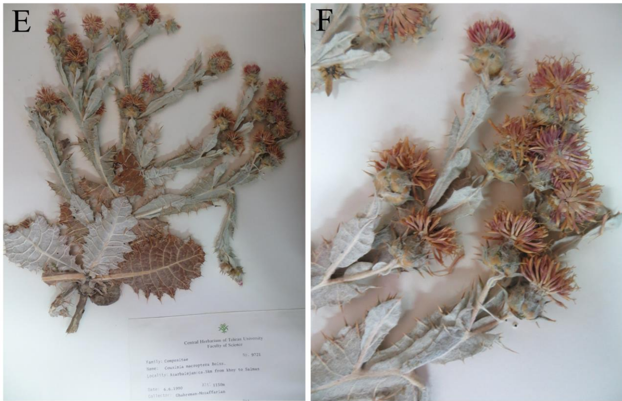
Fig. 2. E-F: Photos of Cousinia macroptera .