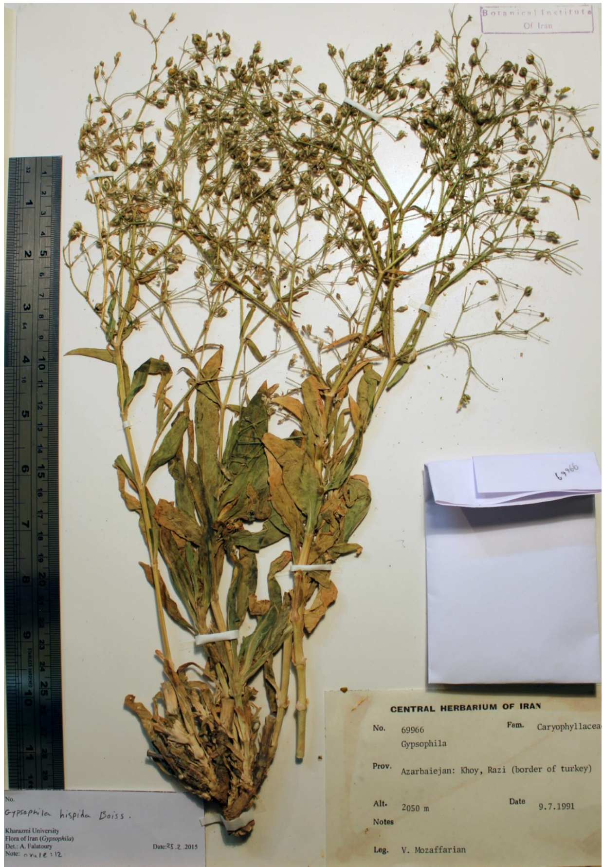
Fig. 1. Gypsophila hispida (V. Mozaffarian 69966, TARI!).