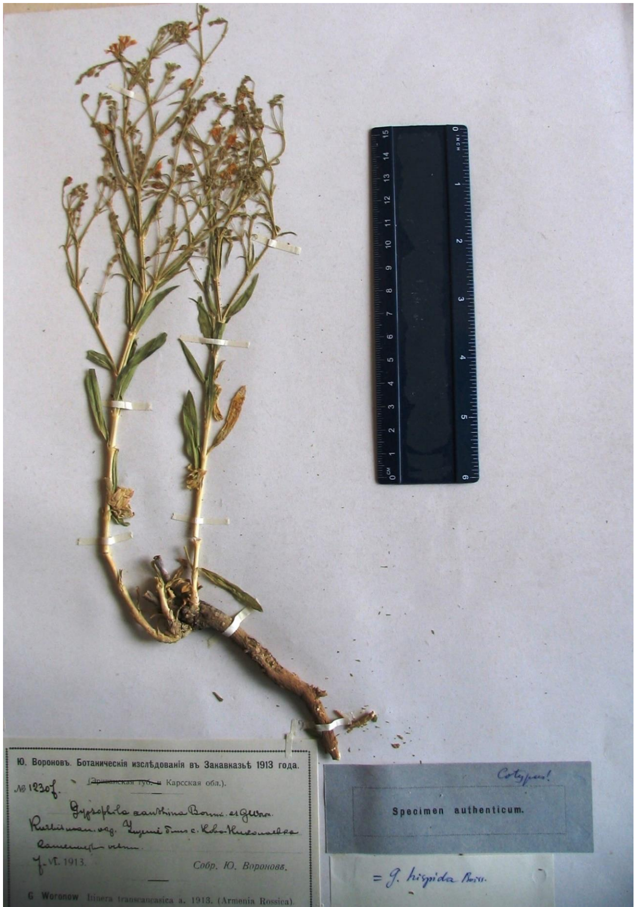
Fig. 2. Syntype of Gypsophila xanthina (Woronow 12307, LE!).