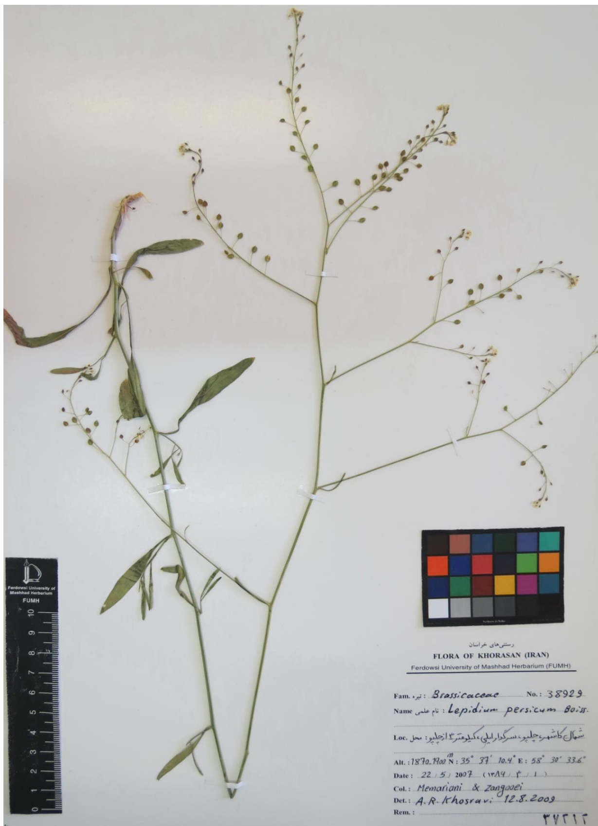
Fig. 1. Lepidium ferganense Korsh.; Memariani & Zangooei 38929 (FUMH).