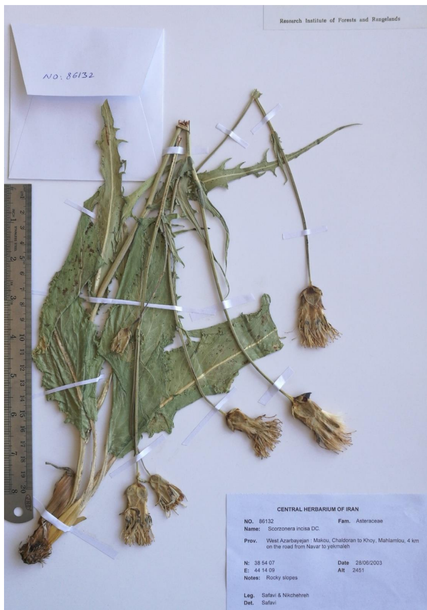
Fig.1. Scorzonera incisa DC. (Safavi & Nikchehreh 86132, TARI).

collected from West Azarbayejan Province in NW Iran and deposited in TARI by the author. After a thorough determination of the specimens, a new record of Scorzonera from Iran was recognized. The new record was compared with a large number of specimens belonging to the Scorzonera species deposited in the herbaria of TARI and the Iranian Research Institute of Plant Protection (IRAN); it was also compared with the published descriptions of Scorzonera species in the flora of Iran and neighboring countries (Chamberlain, 1975; Lipschits, 1964; Rechinger, 1955, 1977; Safavi et al. 2013). After a careful consideration, it was concluded that the specimen was a new record for the flora of Iran, belonging to the Scorzonera incisa DC.