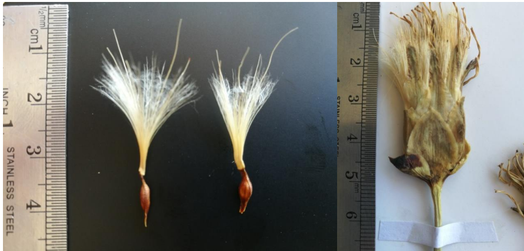
Fig. 2. Scorzonera incisa DC. Achene & Capitule, (Safavi & Nikchehreh 86132, TARI)