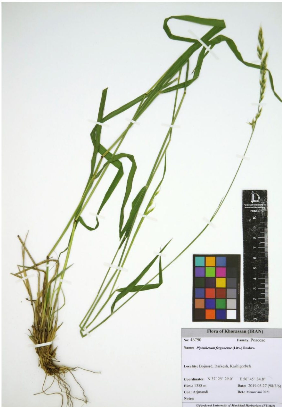
Figure 1. Herbarium specimen of Piptatherum ferganense (Arjmandi 46790-FUMH).