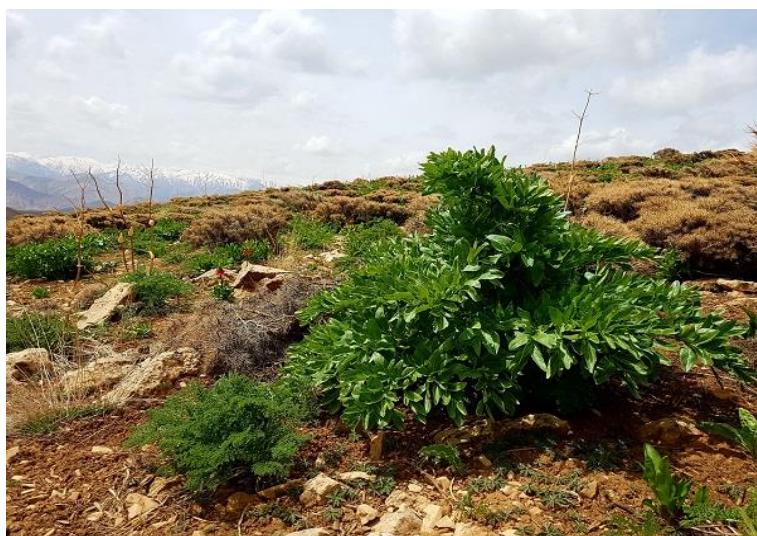
Fig. The natural habitat of Kelussia odoratissima Mozaff. in the Central Zagros

The cultivation of this endangered species presents economic opportunities for local communities while simultaneously contributing to conservation efforts. Harvesters can generate income through various forms of wild celery, including fresh, dried, pickled, and distilled products. Additionally, its foliage serves as an important fodder source, particularly in winter. With its extensive root system and large crown cover, the plant also plays a significant role in preventing soil erosion. Beyond its economic value, Kelussia odoratissima contributes to biodiversity, genetic preservation, and ecotourism due to its unique landscape presence.